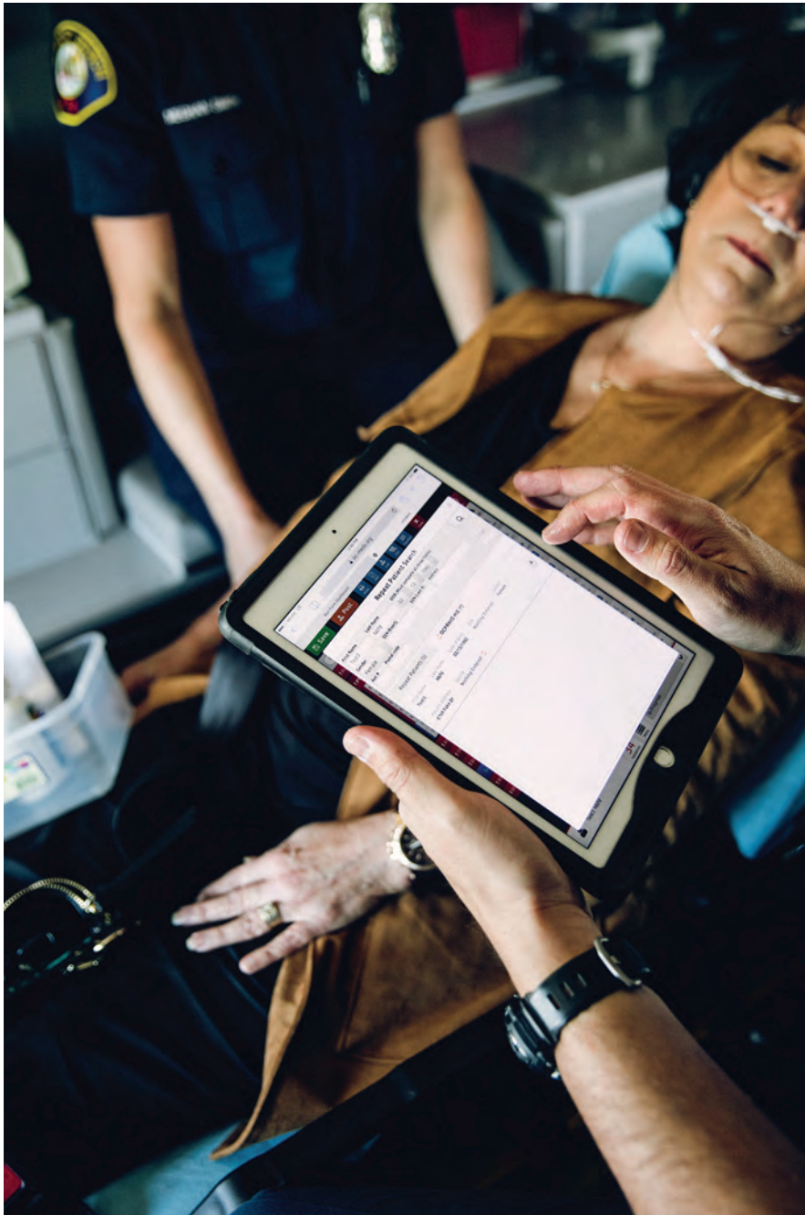
Medics can locate patient care data on the HIE directly from ePCR software. Once the correct patient is identified, the ePCR is populated with the available information.